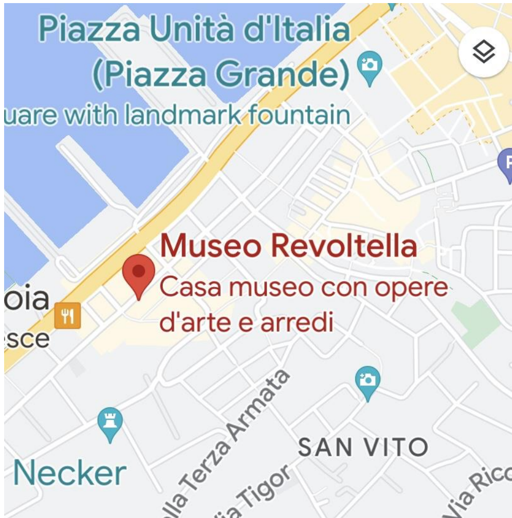
Museo Revoltella Via Armando Diaz, 27, 34123 TRIESTE